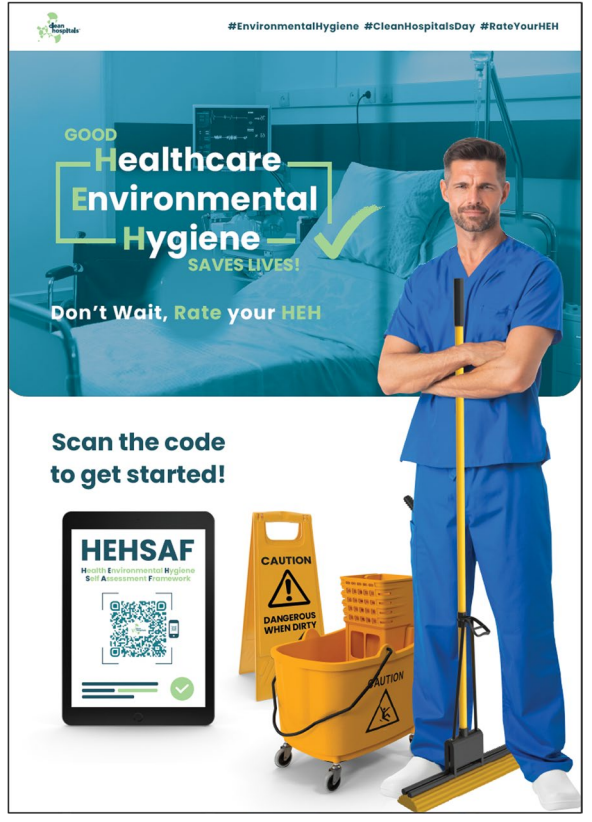
Fig. 1 One of the promotional posters for Clean Hospitals Day, 2023