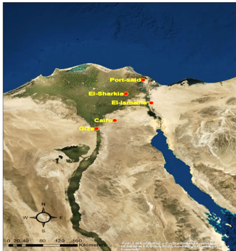
Fig. 1 Location of sampling points in Egypt

The API 20E and API 20NE kits (BioMerieux, France) were used according to the manufacturer's instructions to detect the biochemical profiles of the isolated Enterobacteriaceae and P. aeruginosa , respectively.