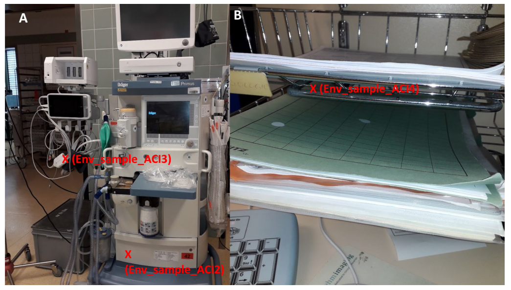
Fig. 2 Positive environmental samples in the operating theatre. A Anesthesia tower in the operating theatre. B Documentation workplace in the operating theatre. Positive sites are marked with "X"

the BICU, and CRAB was found at three environmental sample sites in the operating theatre (e.g., the anesthesia tower; see also the Phylogeny section and Fig. 2) after standard cleaning/disinfection procedures had been performed. Intensified patient screening (twice a week), intensified cleaning/disinfection in the BICU and the operating theatre, and an extensive onsite audit, training and education program for all staff (e.g., healthcare workers, cleaning staff) ended the suspected transmission chain in cluster 2. Case 4 and case 8 were not epidemiologically linked to each other or to the other cases.