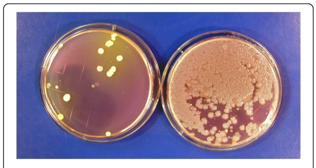
Fig. 1 Contact agar plate cultures showing bacterial colonies recovered from a patient's overbed table before ( left ) and after ( right ) the surface was cleaned by a housekeeper using contaminated quaternary ammonium disinfectant. Colonies on right are Serratia marcescens and Achromobacter xylosoxidans

Contamination of disinfectant solutions can occur, particularly if recommendations for their use are not followed [19-21]. For example, Kampf et al. recently reported that 28 buckets from 9 hospitals contained surface-active disinfectants (e.g., quarternary ammomium solutions) that were contaminated with Achromobacter or Serratia strains [21]. Buckets and roles of wipes had not been handled according to manufacturer recommendations. In studies that involved culturing high-touch surfaces in patient rooms before and shortly after housekeepers had performed routine cleaning, we found that cultures obtained from several surfaces in one room after cleaning yielded large numbers of Serratia and smaller numbers of Achromobacter which were not present before cleaning [Fig. 1] [20]. The housekeeper's bucket of quaternary ammoniumbased disinfectant contained 9.3 \times 10^4 CFUs/ml of gramnegative bacilli (mostly Serratia marcescens and fewer numbers of Achromobacter xylosoxidans). Pulsed-field gel electrophoresis demonstrated that Serratia isolates recovered from the disinfectant were the same strains as those recovered from surfaces in the patient room. Genome sequencing of one of the Serratia strains by collaborating investigators revealed that it contained four different qac resistance genes that permitted the organism to grow and survive in the disinfectant (unpublished data). If