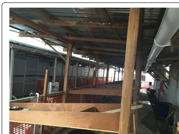
Fig. 1 Ebola treatment centre (ETC), Redemption Hospital, Monrovia, Liberia. Man-made, inexpensive structures allowing for parents and relatives to visit of Ebola virus disease patients and bring them food and other personal items without risking close contact. The wooden structures allow the maintenance of a critical distance between EVD patient and visitors to be respected

Looking at lessons learned, it should be considered that this outbreak had more cases than the total of all previous EVD outbreaks. MSF had never had to manage more than 40 beds or two medical centres before, had never been confronted by a new disease crossing borders, and had never had staff infected. The first lesson is that qualified HCWs continued to volunteer with MSF throughout the crisis; there was no recruitment problem. The second lesson is that some specific places are particularly dangerous, such as triage points, which are dangerous for staff where many of the infections probably occurred. Triage areas and suspect areas tend to group together people with symptoms that could be either EVD or malaria. It is therefore vitally important to supply individual rooms, with low risk corridors leading through high-risk areas. Structures allowing EVD patient to be visited with no risk for cross-transmission are also critical (see Fig. 1). The ETC in Foya, managed by MSF,