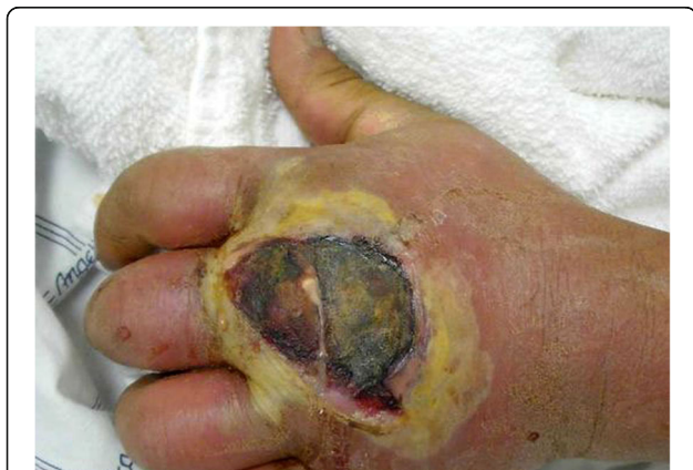
Fig. 1 MRSA infection which would not necessarily be reportable under the bloodstream or invasive infection metrics.

Another observation is that Table 1 is needed to fully explain the data acquisition windows’ length and time periods which are presented in Fig. 2. This adds to the complexity of data analysis and exemplifies the need for a more standardized system of reporting.