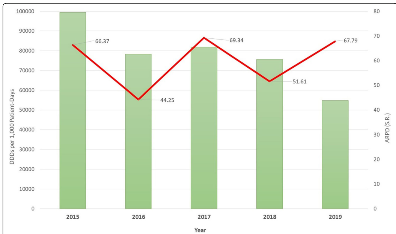
Fig. 2 Total restricted antimicrobials consumption in all four HMG medical facilities before and after implementation of AMS Program, expressed as defined daily doses (DDD) per 1000 patient-days (bars) and antimicrobial riyls per patient day (ARPD, indicated by solid line)

ARPD, which had risen steadily before AMS start, decreased by 33.32% in the first year after AMS implementation (2016), but increased by 4.48% in 2017; this trend was due almost exclusively to the continuous increased use of ciprofloxacin experienced over a period of several years. ARPD fell by 22.23% in 2018; and rose by 2.14% in 2019, a similar ARPD pre- AMS implementation, attributed to the biggest DDDs consumption for ciprofloxacin of all restricted antimicrobials throughout the whole 5 yrs ( p = 0.648 ) (Table 1). Use of ciprofloxacin was high due to many advantageous pharmacokinetic properties including high oral bioavailability, large volume of distribution, and broad-spectrum antimicrobial activity against aerobic, enteric gram-negative bacilli (eg,